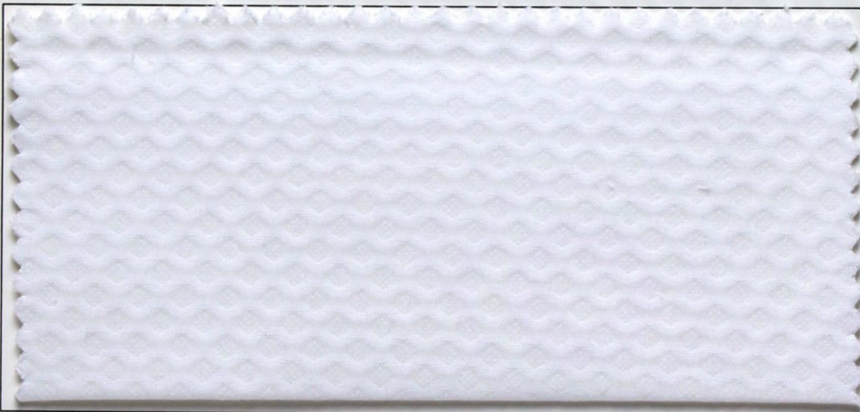
PIMA SUPER BULLSEYE