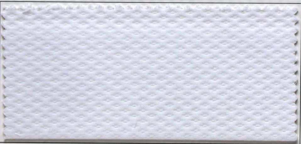
PIMA PRINCESS BULLSEYE