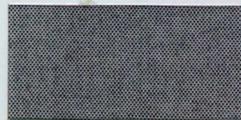
SALT & PEPPER