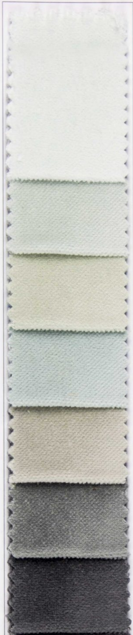
Robin's Egg Blue